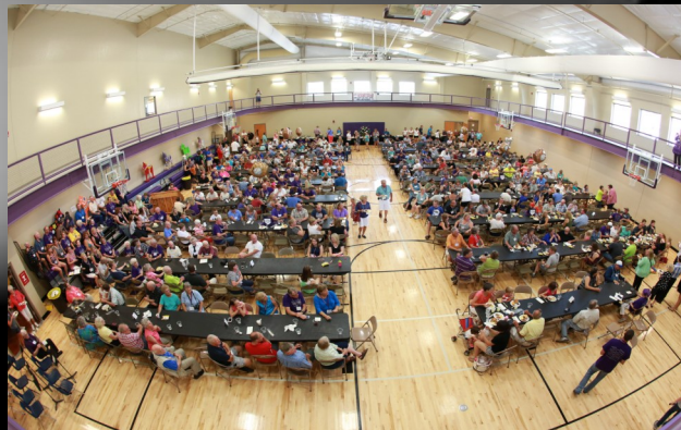
Stanton Homecoming 2015

*Added to your monthly bank draft membership