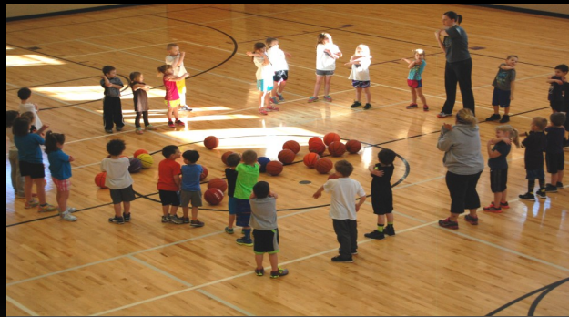
Lil' Vikes Basketball Program 2016